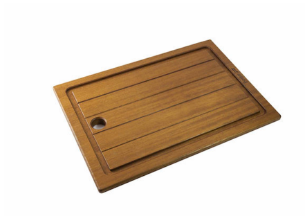
Iroko-wood chopping board 8643 117